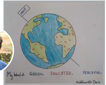
Syed Zain Aijaz, 3.4 years (Son - Zoya Siddiqui)