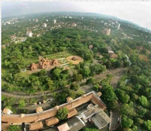
Figure 2: Aerial View of the King's Way

The Royal Road, colloquially deemed the 'King's Way', is another characteristic boulevard of the city. Stretching from Kowdiar to LMS and continuing henceforth as the MG road, the stretch is exemplified by lush greenery and a string of large complexes along its edges, namely the Napier museum, Kanakakunnu palace, Golf links, Kowdiar Palace, Governor's residence, Tennis Club and so on. On sultry sunrises or evening occasions, the green corridor is a public haven for countless strollers and joggers, sprawling the tree-lined avenue.