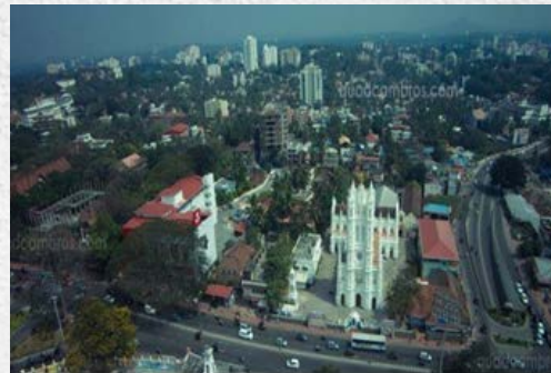
Figure 1: Aerial View of MG road

heritage and contemporary landmarks align the aptly named Mahatma Gandhi (MG) road. The MG road is the arterial thoroughfare that exhibits a plethora of styles such as the prime shopping district, the political nerve, the institutional spine, the entertainment aisle, and the heritage hallway with the formidable East Fort, Padmanabhaswamy temple and the Chalai Bazar forming the so-called CBD.