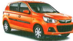
Its official now: Maruti Suzuki set to launch next generation Alto K10 on Nov 3