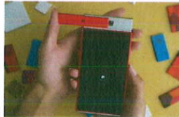
How Google wants to rule the smartphone market