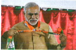
Efforts to bring back black money on right track: PM Narendra Modi