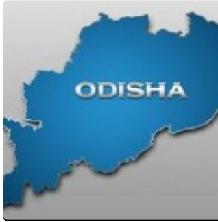
Odisha to hold road shows in Israel, Britain to invite foreign investments