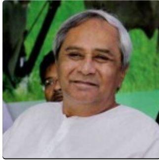
Odisha wins Krishi Karman Award for fourth time