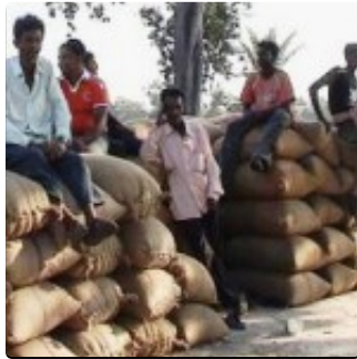
P-PAS system to be extended to 100 more blocks in Odisha