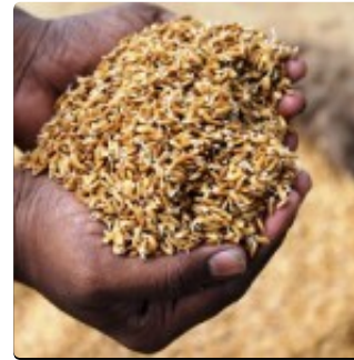
Odisha expects good paddy yield this year