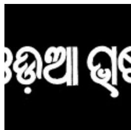
Finally Odisha Government now