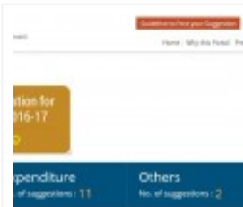
Now you can help Odisha Govt in